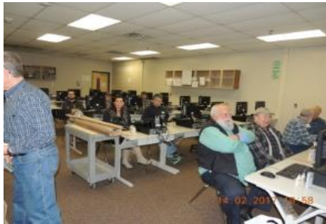
This picture shows ONLY HALF of the total number of Woodworkers who attended the Titebond Seminar